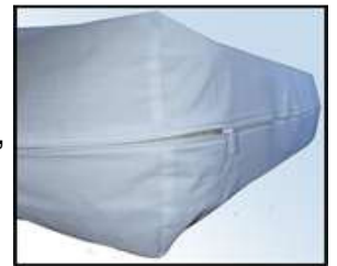
A zippered mattress cover can help protect against bed bugs