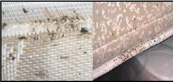
Bed bug fecal matter and “blood spots” are often found along seams of mattresses