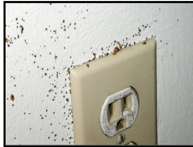
Bed bugs and droppings can be seen around outlet covers in heavy infestations