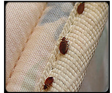
Bed bugs prefer soft materials like upholstered furniture